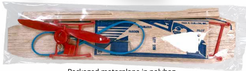
Packaged motorplane in polybag

Biplane Motorplane! Combines the nostalgia of a biplane with the fun exciting flights of a rubber powered propeller plane. Large imprint area on top wing.