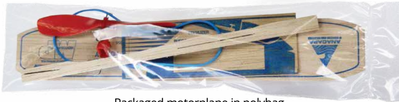
Packaged motorplane in polybag

Rubber Powered Motorplane! Everyone remembers the shiny red propeller on the front of this plane & its rubber motor. Wind it up, let go and have your message SOAR!