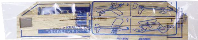
26-1 packaged glider in polybag