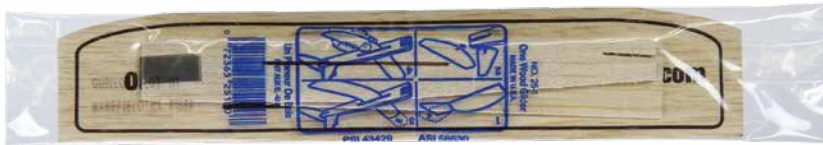
25-1 packaged glider in polybag