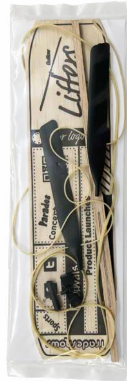
Packaged lifter in polybag

High Flying Helicopter! This rubber band powered helicopter has a huge imprint area on its balsa "wing". Wind it up and get your message UP over 40ft up for all to notice.